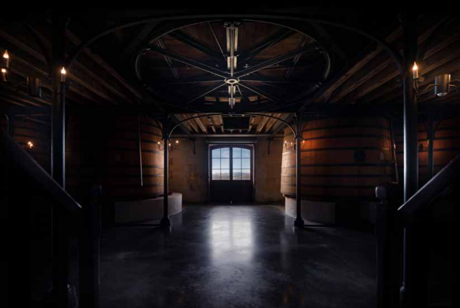
Vat room in Chateau Pontet Canet.