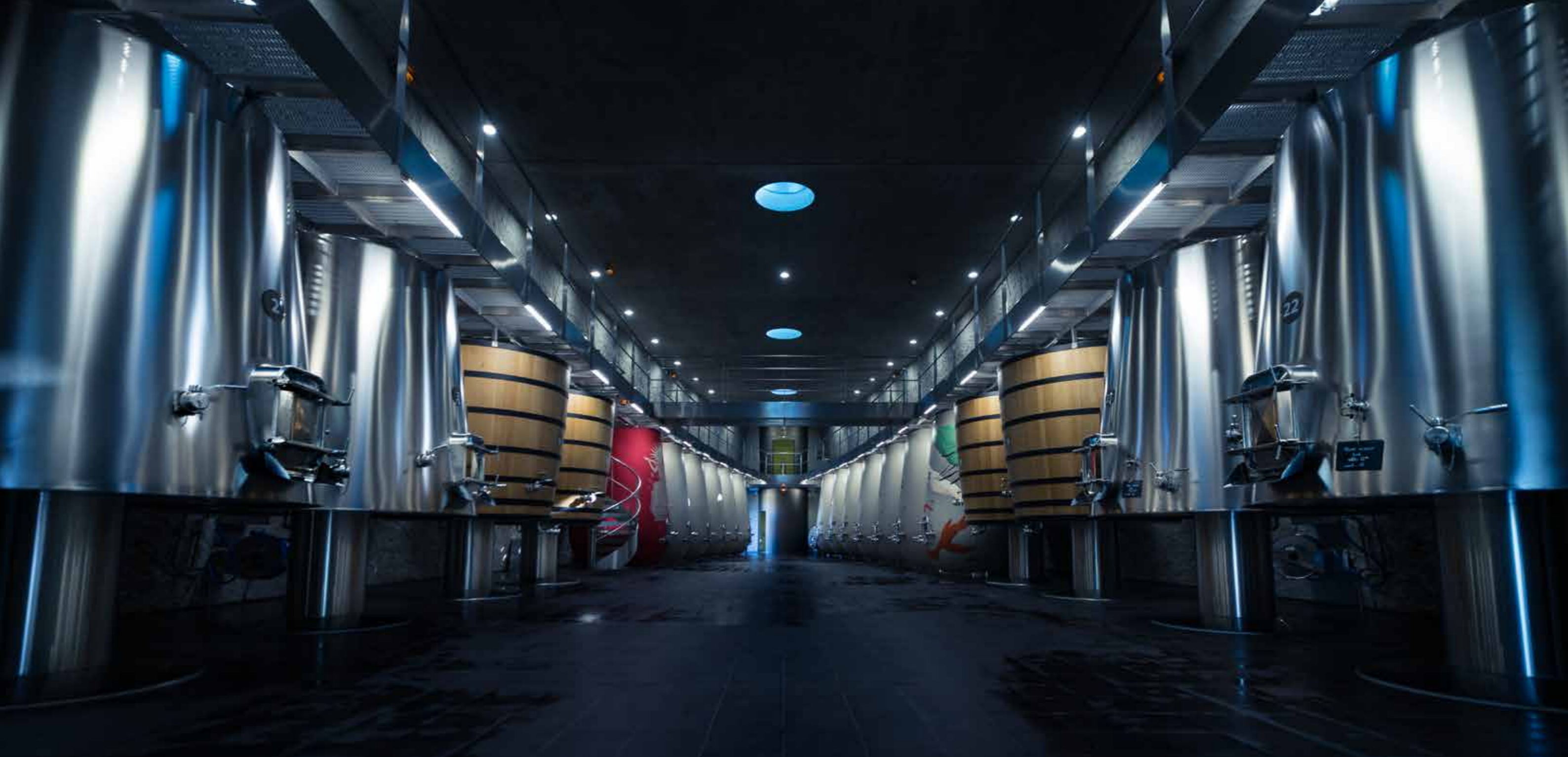
Vat room in Chateau Les Carmes Haut Brion.