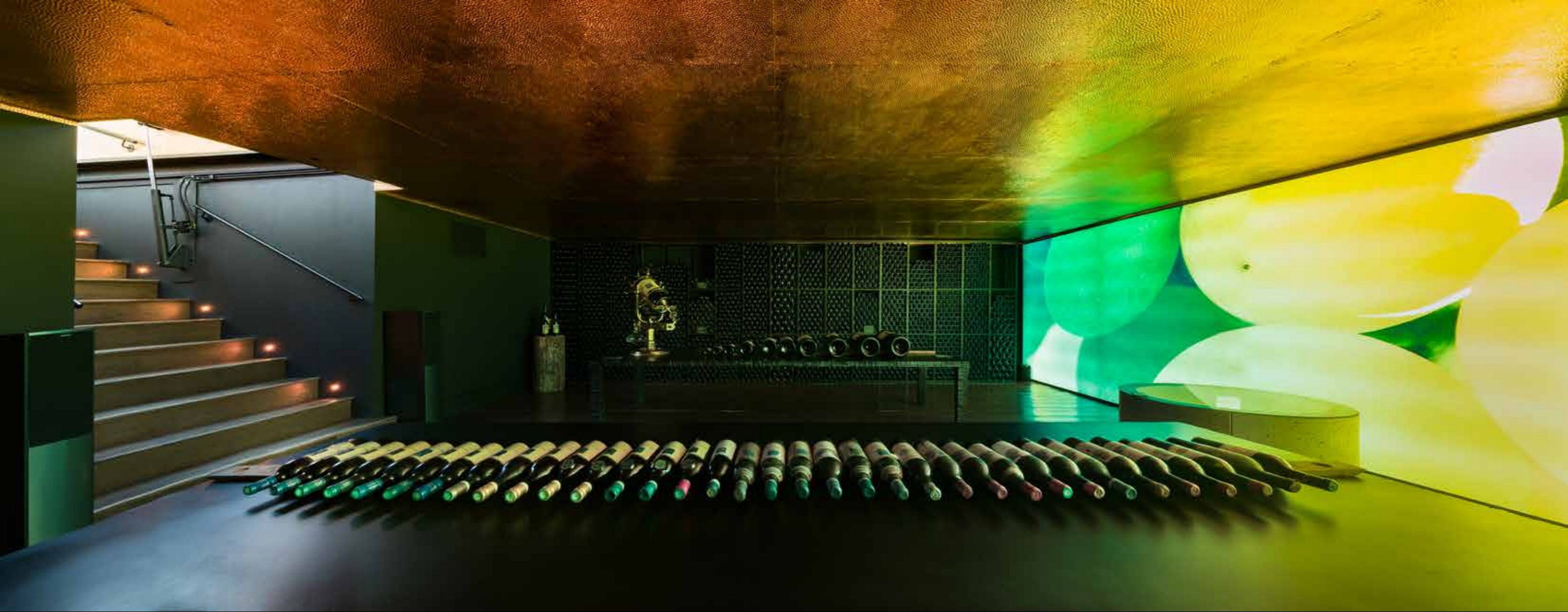
Library cellar at Chateau Smith Haut Lafitte.