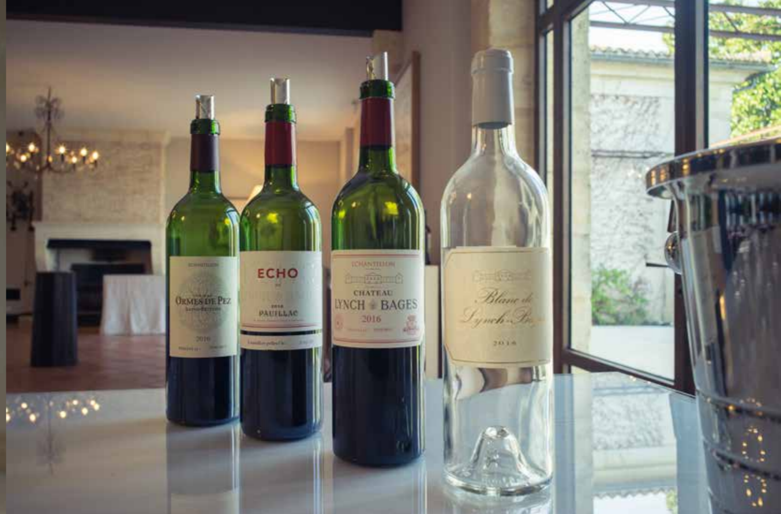
Tasting at Chateau Les Ormes de Pez in Saint Estephe, a property of the Cazes family.