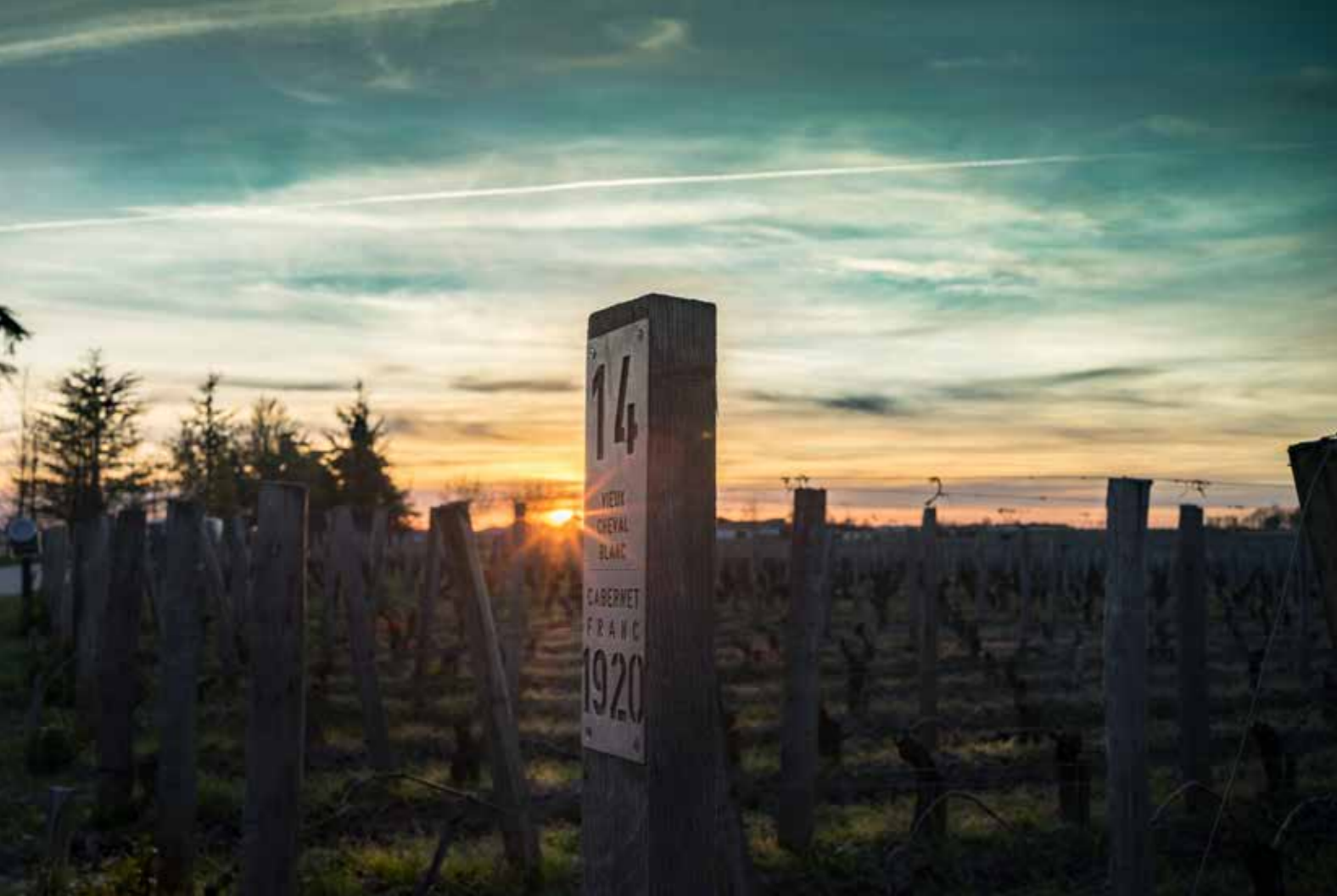
Chateau Cheval Blanc, Saint Emilion.

and the palate followed through with perfect integration of deep red fruits and a touch of spice, and an ultra long finish, welcome to the world of 100+ points!