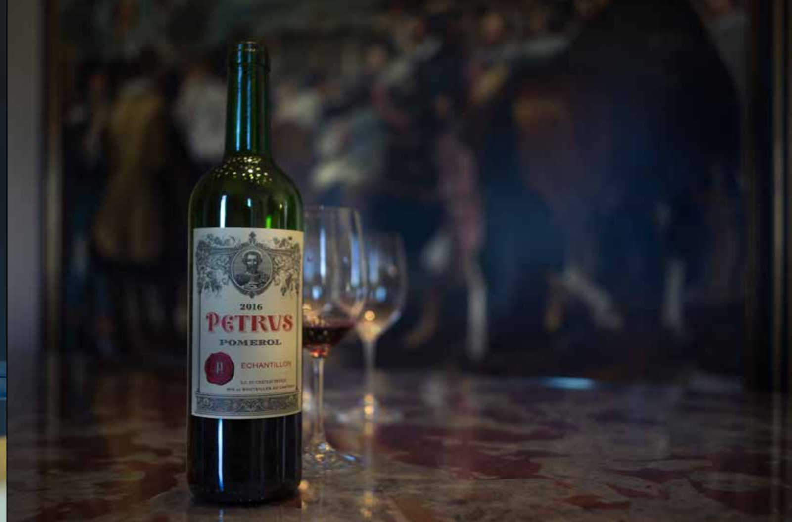
Chateau Petrus, Pomerol.

Pape Clement is a heavyweight, with toasty aromas and very rich black fruits; in contrast but equally great, Haut Bailly is very classy, elegant and pure, which gives Haut Brion a run for the money!